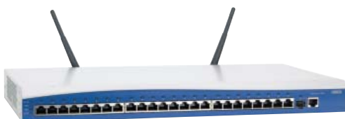
NetVanta 1335 with PoE and Wi-Fi