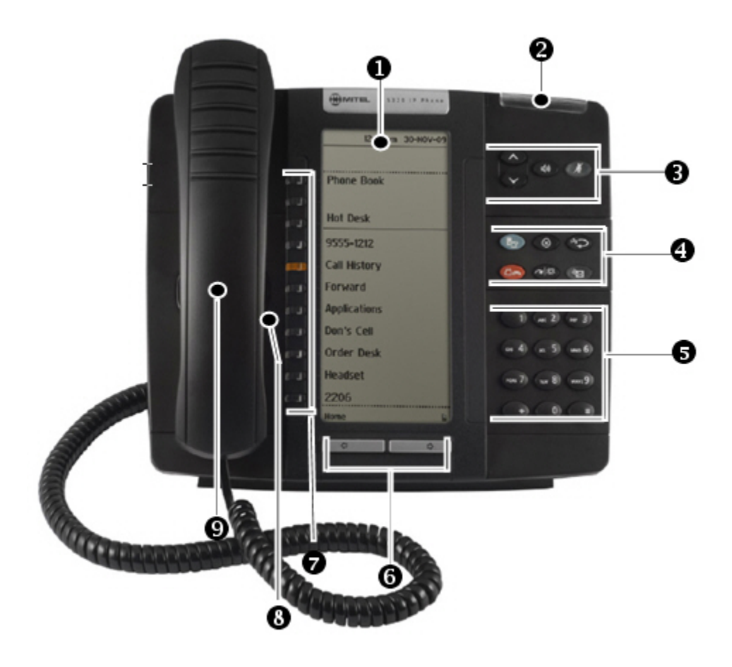
The 5320 IP Phone

The 5320 IP Phone supports Mitel Call Control (MiNet) protocol and session initiated protocols (SIP). It also supports Hot Desking and Clustered Hot Desking as well as Resiliency. The 5320 phone is ideal for executives and managers, and can be used as an ACD Agent or Supervisor Phone, as well as a Teleworker Phone.